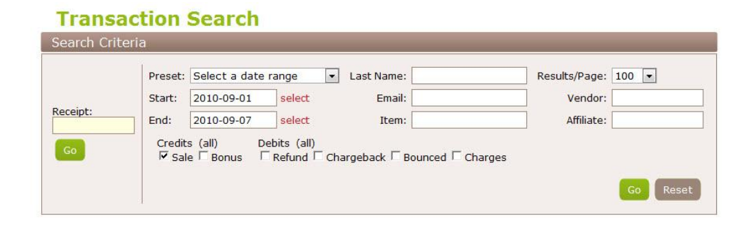
Start Making Money Today

Clickbank® has an excellent search dashboard for you to use.